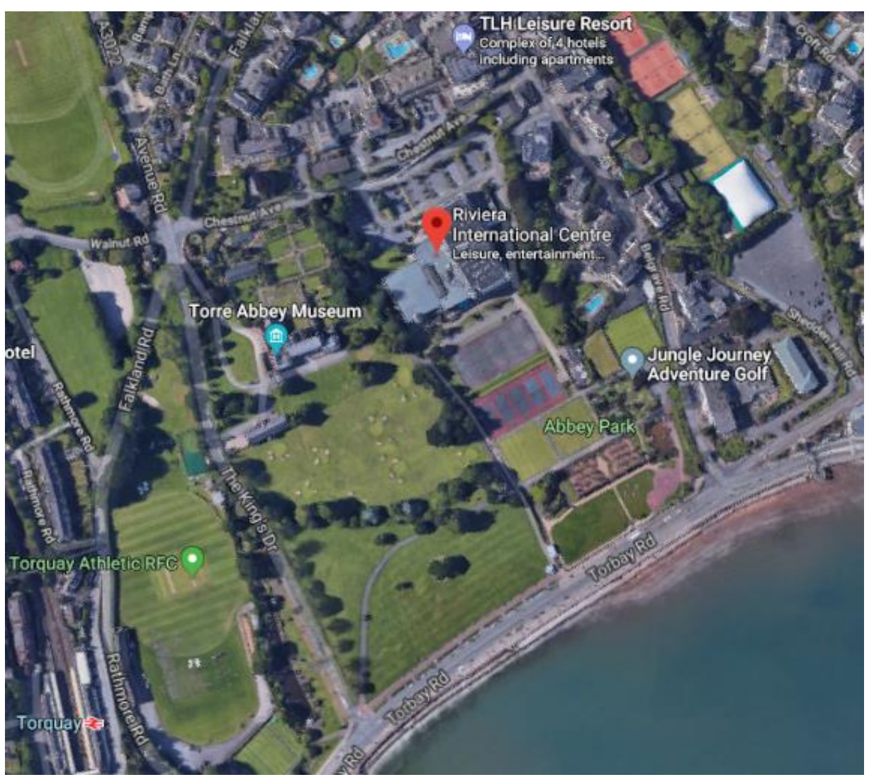
Figure 1 Aerial Plan of the Site

Appendices to the market brief include a tree survey and a topographical survey which provide greater detail of the site environment. The site levels rise steeply from the sea to the top of the site and also the drop into the car park at Chestnut Avenue is quite steep. There are a number of mature trees within the site and areas of denser planting. Formal footpaths pass through the parkland and provide access to the Torre Abbey museum and conference facilities and to the outdoor recreational facilities. The core site comprises a total area of approximately 2.57 Ha/6.36 acres.